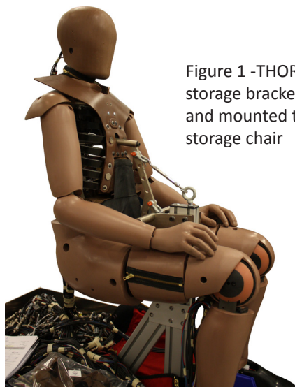
Figure 1 -THOR-M with storage bracket installed and mounted to the storage chair

The storage bracket attaches to both the upper portion of the spine box and the pelvis assembly in order to stabilize the flexible rubber lumbar segments in between (Figure 1). Shackles are provided as an attachment point for a winch lifting hook. Shackles can be repositioned at any available hole in the storage bracket. Handles are also provided for manual lifting or to assist in finer positioning before the bracket is removed.